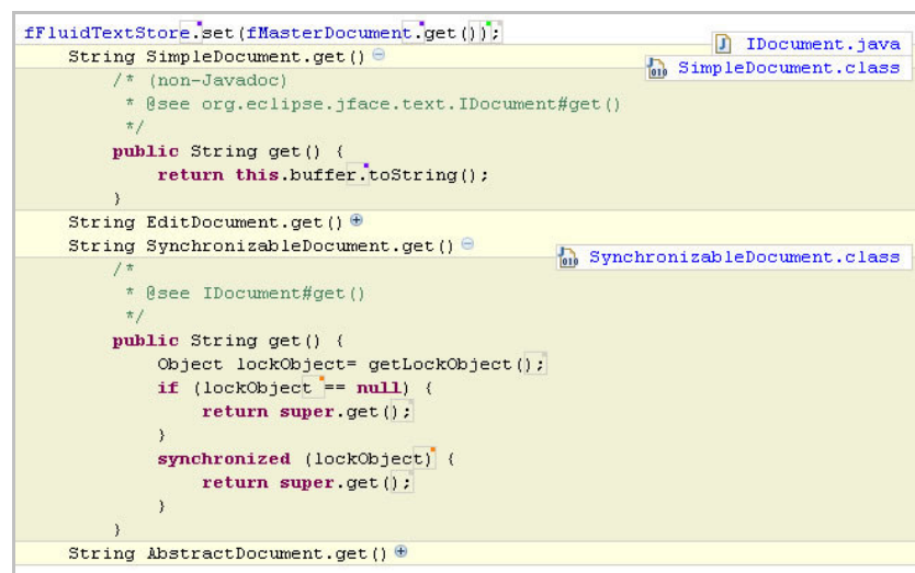
Figure 5 The inline introduction of search results, in this case the concrete implementations of an abstract method.

Upon expansion of an interface or abstract method reference the fluid editor first runs a workspace wide search for all corresponding declarations. An inline display is then introduced containing the list of computed declarations.